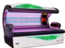
Charcoal Grey Matte